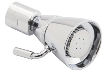
Model A-752 Series

Omni® Model A-752 Series Showerhead flow controls are ideal for schools, correctional facilities, hotels, motels, military installations, healthcare facilities, residential applications and other locations where pressure compensating & precise flow control at specific flow rates is needed.