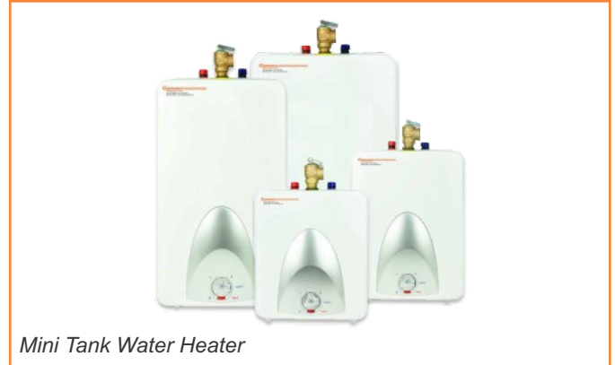
Mini Tank Water Heater

The Chronomite Mini Tank Water Heaters can be used in most under the counter, point of use applications. Models CMT-1.3, CMT-2.5, CMT-4.0 and CMT-6.0 are designed to supply hot water for all Hand Wash and Kitchen Sinks in a residential, commercial or industrial environment. These heaters can replace traditional central hot water heaters thereby conserving water and reducing energy waste. The Chronomite Mini tank Water Heaters are lightweight, compact, manufactured for easy installation, and designed to be mounted on the wall.